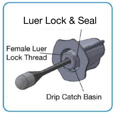
Luer Lock & Seal

Female Luer Lock Thread Drip Catch Basin